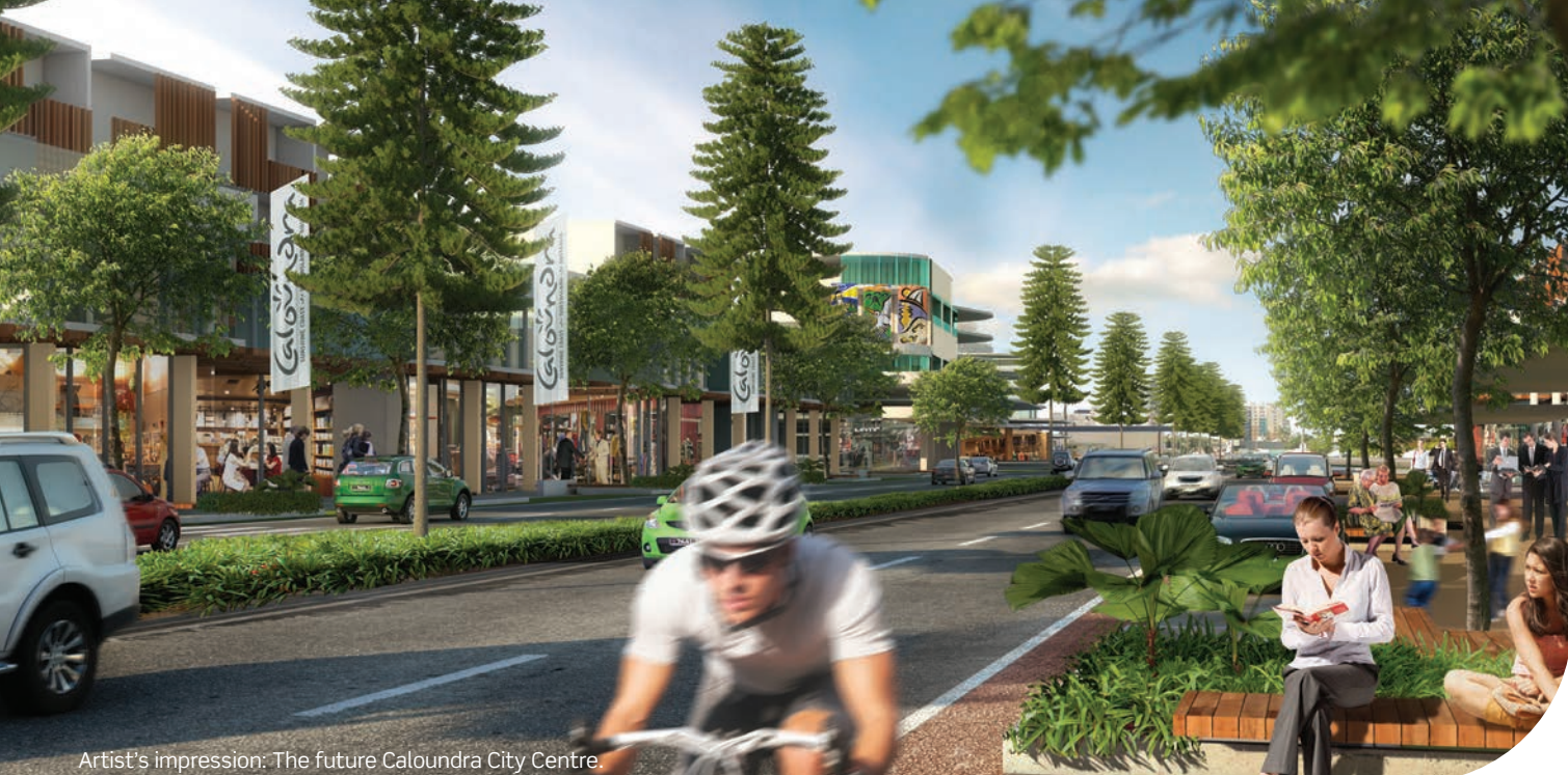
Artist's impression: The future Caloundra City Centre.